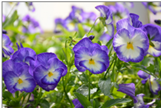
Halo Lilac Pansy flowers

Halo Lilac Pansy is recommended for the following landscape applications;