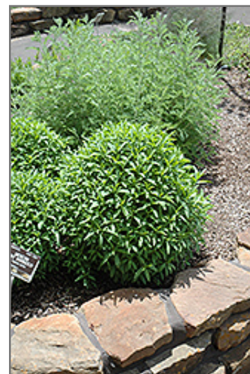
Mexican Tarragon