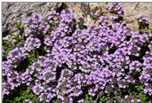
Purple Carpet Creeping Thyme flowers