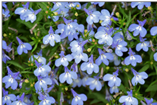
Techno Upright Light Blue Lobelia flowers

Techno Upright Light Blue Lobelia is recommended for the following landscape applications;