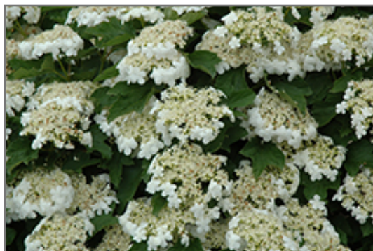
Compact European Cranberry flowers