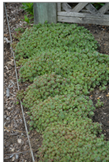
Lime Zinger Stonecrop

Lime Zinger Stonecrop is a fine choice for the garden, but it is also a good selection for planting in outdoor pots and containers. Because of its spreading habit of growth, it is ideally suited for use as a 'spiller' in the 'spiller-thriller-filler' container combination; plant it near the edges where it can spill gracefully over the pot. Note that when growing plants in outdoor containers and baskets, they may require more frequent waterings than they would in the yard or garden.