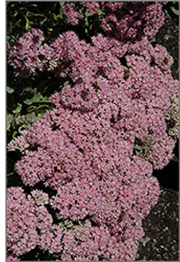
Lime Zinger Stonecrop flowers

Lime Zinger Stonecrop is recommended for the following landscape applications;