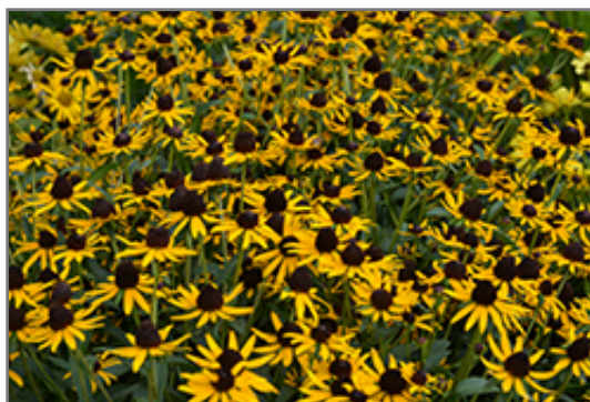
Little Goldstar Coneflower flowers