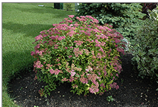
Goldflame Spirea in bloom