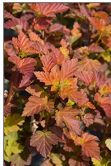
Amber Jubilee Ninebark foliage

Amber Jubilee Ninebark is recommended for the following landscape applications;