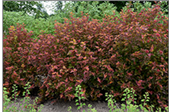
Amber Jubilee Ninebark

This shrub does best in full sun to partial shade. It is very adaptable to both dry and moist locations, and should do just fine under average home landscape conditions. It is not particular as to soil type or pH. It is highly tolerant of urban pollution and will even thrive in inner city environments. This is a selection of a native North American species.