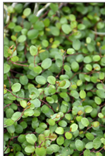
Creeping Wire Vine foliage