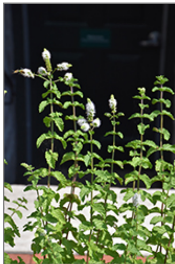
Spearmint flowers