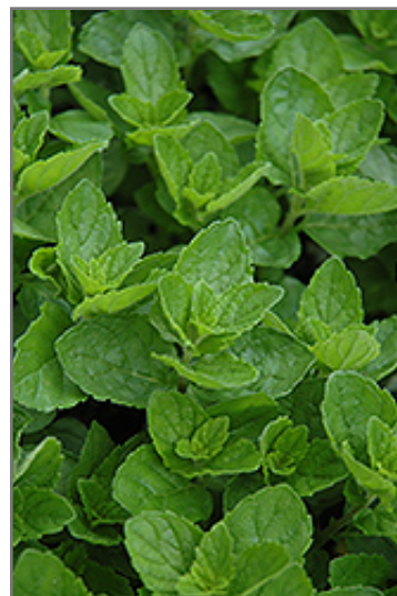
Spearmint foliage