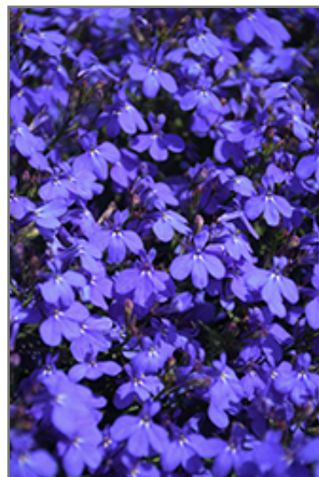
Techno Electric Blue Lobelia flowers

Techno Electric Blue Lobelia is recommended for the following landscape applications;