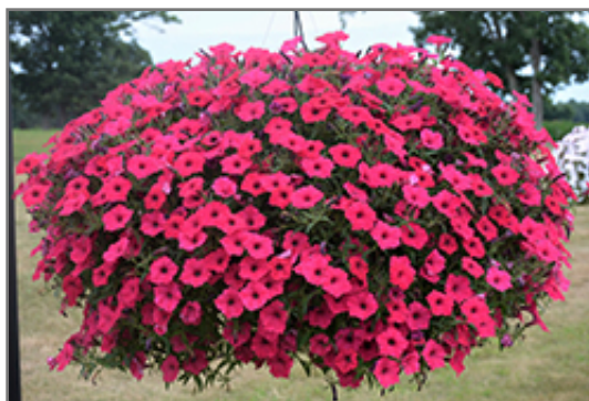
Supertunia Vista Fuchsia Petunia in bloom