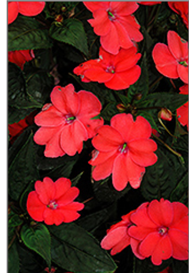
SunPatens Compact Coral New Guinea Impatiens flowers