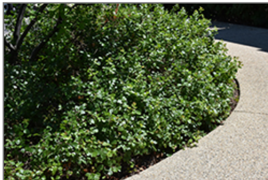
Gro-Low Fragrant Sumac