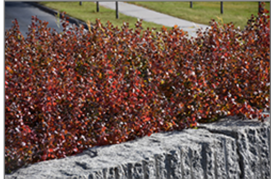
Gro-Low Fragrant Sumac in fall

This shrub performs well in both full sun and full shade. It is very adaptable to both dry and moist locations, and should do just fine under typical garden conditions. It is not particular as to soil type, but has a definite preference for acidic soils, and is subject to chlorosis (yellowing) of the foliage in alkaline soils. It is highly tolerant of urban pollution and will even thrive in inner city environments. Consider applying a thick mulch around the root zone in winter to protect it in exposed locations or colder microclimates. This is a selection of a native North American species.