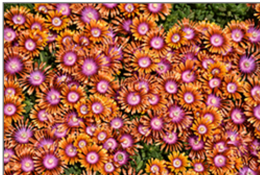
Fire Spinner Ice Plant in bloom