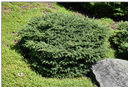
Birds Nest Spruce