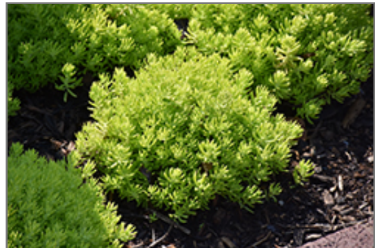
Lemon Coral Stonecrop