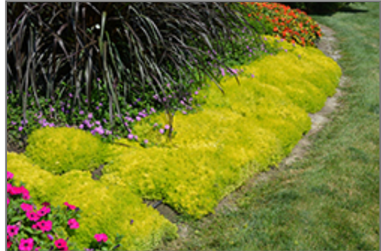
Lemon Coral Stonecrop

This plant does best in full sun to partial shade. It prefers dry to average moisture levels with very well-drained soil, and will often die in standing water. It is considered to be drought-tolerant, and thus makes an ideal choice for a low-water garden or xeriscape application. It is not particular as to soil pH, but grows best in poor soils, and is able to handle environmental salt. It is highly tolerant of urban pollution and will even thrive in inner city environments. This is a selected variety of a species not originally from North America. It can be propagated by division; however, as a cultivated variety, be aware that it may be subject to certain restrictions or prohibitions on propagation.