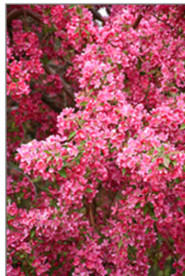
Prairifire Flowering Crab flowers