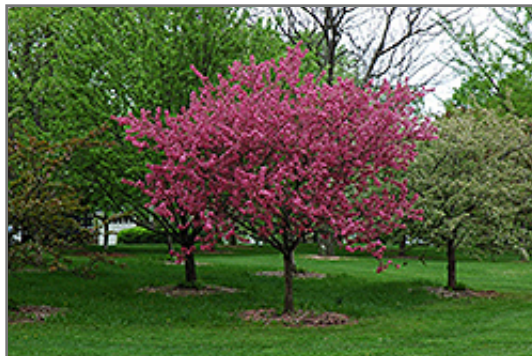
Prairifire Flowering Crab in bloom