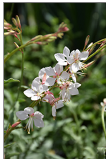
Whirling Butterflies Gaura flowers

Whirling Butterflies Gaura is recommended for the following landscape applications;