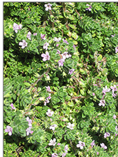
Pink Chintz Creeping Thyme flowers