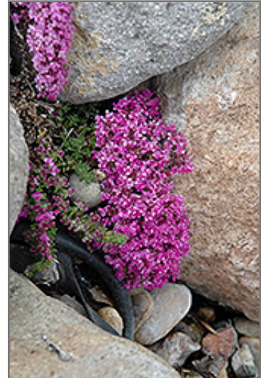
Pink Chintz Creeping Thyme in bloom

This plant should only be grown in full sunlight. It prefers to grow in average to dry locations, and dislikes excessive moisture. It is considered to be drought-tolerant, and thus makes an ideal choice for a low-water garden or xeriscape application. It is not particular as to soil type or pH. It is highly tolerant of urban pollution and will even thrive in inner city environments. Consider covering it with a thick layer of mulch in winter to protect it in exposed locations or colder microclimates. This is a selected variety of a species not originally from North America. It can be propagated by division; however, as a cultivated variety, be aware that it may be subject to certain restrictions or prohibitions on propagation.