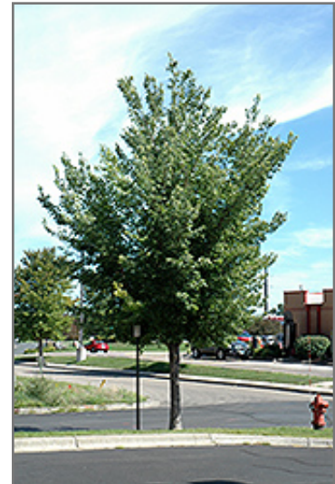
Common Hackberry