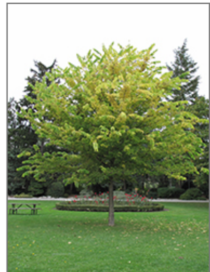
Common Hackberry in fall