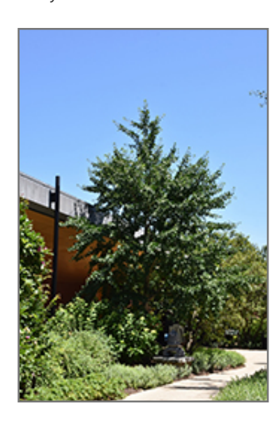
Autumn Gold Ginkgo