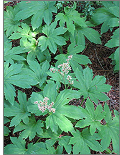
Crimson Fans Mukdenia flowers

Crimson Fans Mukdenia is a fine choice for the garden, but it is also a good selection for planting in outdoor pots and containers. It is often used as a 'filler' in the 'spiller-thriller-filler' container combination, providing a mass of flowers and foliage against which the larger thriller plants stand out. Note that when growing plants in outdoor containers and baskets, they may require more frequent waterings than they would in the yard or garden.