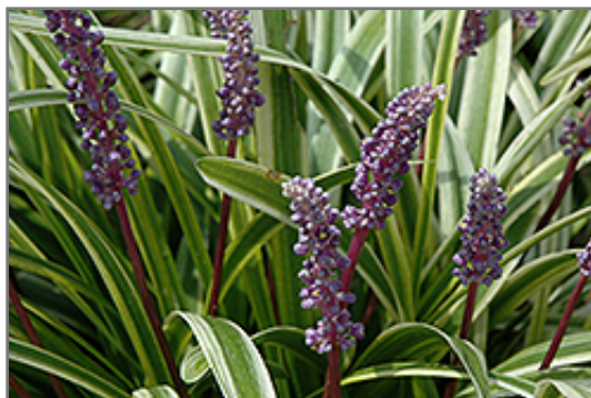
Variegata Lily Turf flowers