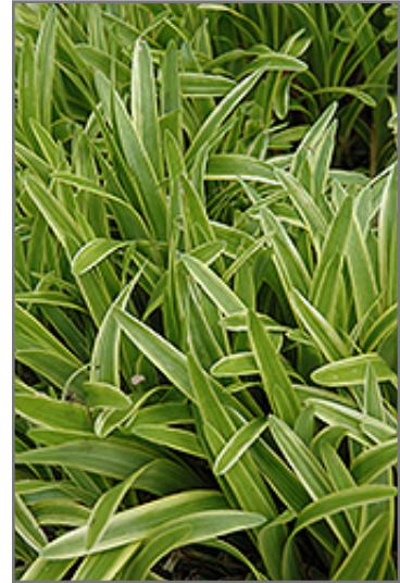
Variegata Lily Turf foliage

This plant does best in partial shade to shade. It does best in average to evenly moist conditions, but will not tolerate standing water. It is not particular as to soil type or pH. It is somewhat tolerant of urban pollution. This is a selected variety of a species not originally from North America. It can be propagated by division; however, as a cultivated variety, be aware that it may be subject to certain restrictions or prohibitions on propagation.