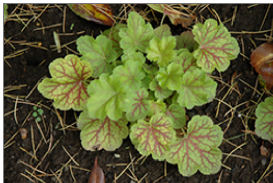
Electric Lime Coral Bells