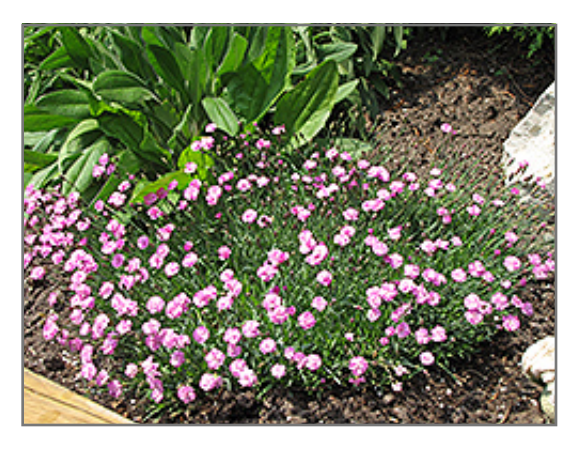
Tiny Rubies Dwarf Mat Pinks in bloom

5301 E. Terra Cotta Ave. Crystal Lake, IL. 60014 countrysideflowershop.com