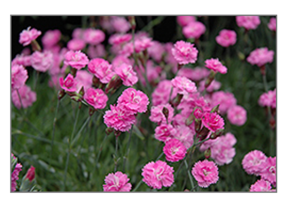
Tiny Rubies Dwarf Mat Pinks flowers

Tiny Rubies Dwarf Mat Pinks is recommended for the following landscape applications;