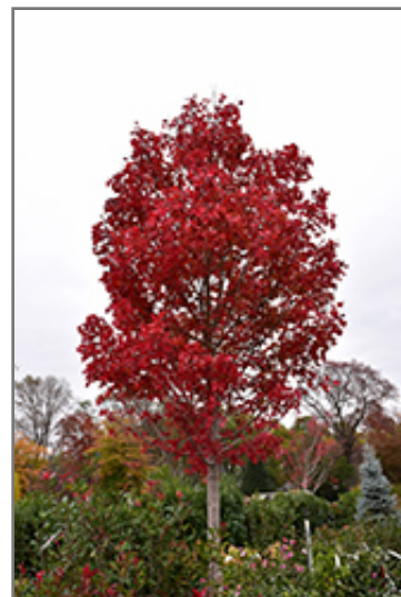
October Glory Red Maple in fall