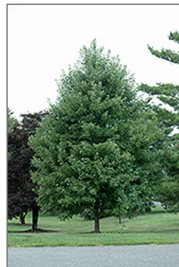
October Glory Red Maple