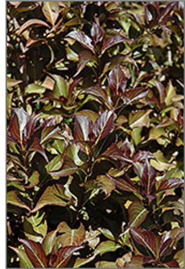
Dark Horse Weigela foliage

Dark Horse Weigela makes a fine choice for the outdoor landscape, but it is also well-suited for use in outdoor pots and containers. Because of its height, it is often used as a 'thriller' in the 'spiller-thriller-filler' container combination; plant it near the center of the pot, surrounded by smaller plants and those that spill over the edges. It is even sizeable enough that it can be grown alone in a suitable container. Note that when grown in a container, it may not perform exactly as indicated on the tag - this is to be expected. Also note that when growing plants in outdoor containers and baskets, they may require more frequent waterings than they would in the yard or garden.