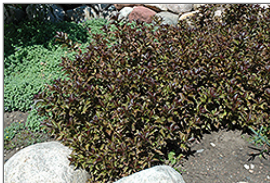
Dark Horse Weigela