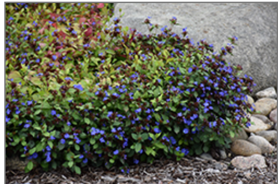
Plumbago in bloom