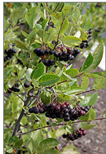
Iroquois Beauty Black Chokeberry fruit