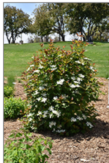
Redwing Highbush Cranberry in bloom