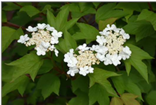
Redwing Highbush Cranberry flowers

Redwing Highbush Cranberry is a dense multi-stemmed deciduous shrub with an upright spreading habit of growth. Its average texture blends into the landscape, but can be balanced by one or two finer or coarser trees or shrubs for an effective composition.