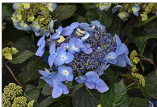
Endless Summer Pop Star Hydrangea flowers