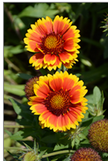
Arizona Sun Blanket Flower flowers

Arizona Sun Blanket Flower is recommended for the following landscape applications;