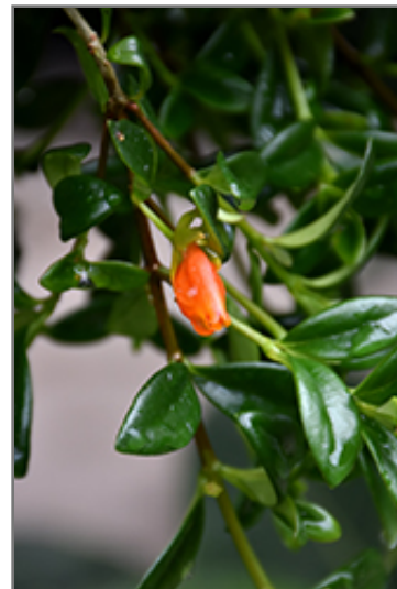
Goldfish Plant flowers

When grown indoors, Goldfish Plant can be expected to grow to be about 3 feet tall at maturity, with a spread of 3 feet. It grows at a slow rate, and under ideal conditions can be expected to live for approximately 10 years. This houseplant will do well in a location that gets either direct or indirect sunlight, although it will usually require a more brightly-lit environment than what artificial indoor lighting alone can provide. It does best in average to evenly moist soil, but will not tolerate standing water. The surface of the soil shouldn't be allowed to dry out completely, and so you should expect to water this plant once and possibly even twice each week. Be aware that your particular watering schedule may vary depending on its location in the room, the pot size, plant size and other conditions; if in doubt, ask one of our experts in the store for advice. It will benefit from a regular feeding with a general-purpose fertilizer with every second or third watering. It is not particular as to soil pH, but grows best in rich soil. Contact the store for specific recommendations on pre-mixed potting soil for this plant.