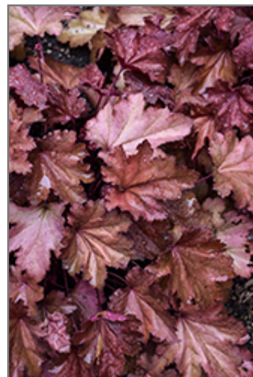
Magma Coral Bells foliage