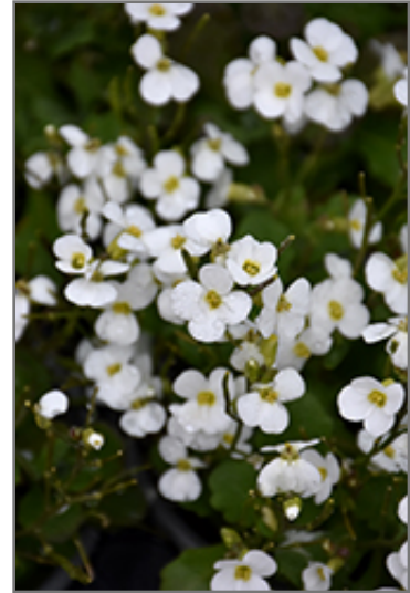
Catwalk White Wall Cress flowers