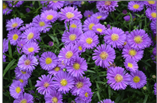
Magic Purple Aster flowers

Magic Purple Aster is recommended for the following landscape applications;