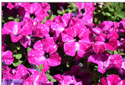
Headliner Enchanted Sky Petunia flowers