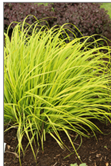
Prairie Winds Lemon Squeeze Fountain Grass

Prairie Winds Lemon Squeeze Fountain Grass is recommended for the following landscape applications;