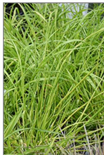
Prairie Winds Lemon Squeeze Fountain Grass foliage