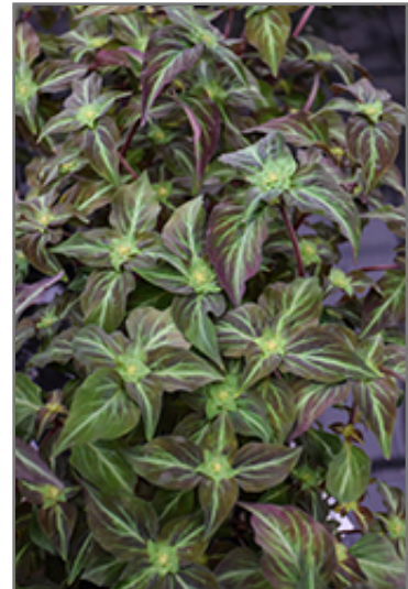
Night Light Moneywort foliage

Night Light Moneywort is recommended for the following landscape applications;