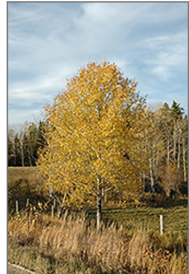
Trembling Aspen in fall

This tree should only be grown in full sunlight. It is an amazingly adaptable plant, tolerating both dry conditions and even some standing water. It is considered to be drought-tolerant, and thus makes an ideal choice for xeriscaping or the moisture-conserving landscape. It is not particular as to soil type or pH. It is quite intolerant of urban pollution, therefore inner city or urban streetside plantings are best avoided. This species is native to parts of North America.