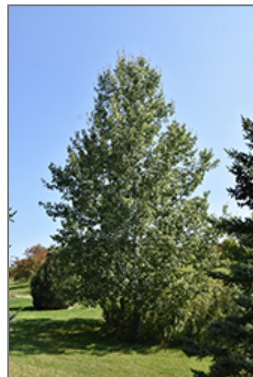
Trembling Aspen