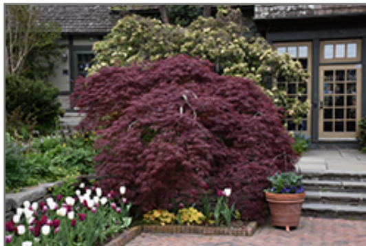
Tamukeyama Japanese Maple

Tamukeyama Japanese Maple is recommended for the following landscape applications;