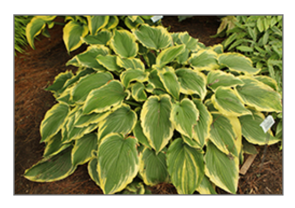
Drop Dead Gorgeous Hosta