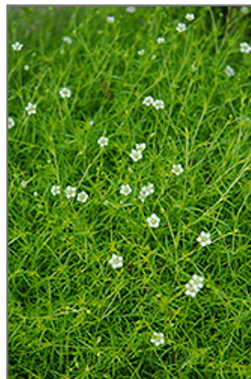
Scotch Moss flowers

Scotch Moss will grow to be only 1 inch tall at maturity, with a spread of 12 inches. Its foliage tends to remain low and dense right to the ground. It grows at a medium rate, and under ideal conditions can be expected to live for approximately 10 years. As an evergreen perennial, this plant will typically keep its form and foliage year-round.