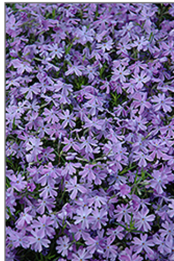
Emerald Blue Moss Phlox flowers