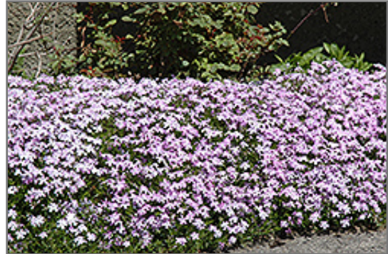
Emerald Blue Moss Phlox in bloom

This plant does best in full sun to partial shade. It prefers dry to average moisture levels with very well-drained soil, and will often die in standing water. It is considered to be drought-tolerant, and thus makes an ideal choice for a low-water garden or xeriscape application. It is not particular as to soil type, but has a definite preference for alkaline soils. It is highly tolerant of urban pollution and will even thrive in inner city environments. Consider covering it with a thick layer of mulch in winter to protect it in exposed locations or colder microclimates. This is a selection of a native North American species. It can be propagated by division; however, as a cultivated variety, be aware that it may be subject to certain restrictions or prohibitions on propagation.