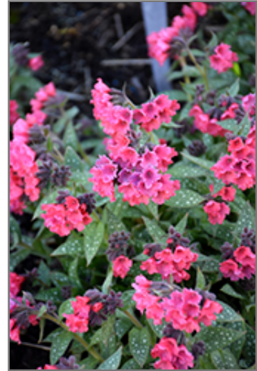
Shrimps On The Barbie Lungwort flowers

Shrimps On The Barbie Lungwort is recommended for the following landscape applications;