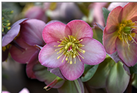
FrostKiss Cheryl's Shine Hellebore flowers

FrostKiss Cheryl's Shine Hellebore is recommended for the following landscape applications;