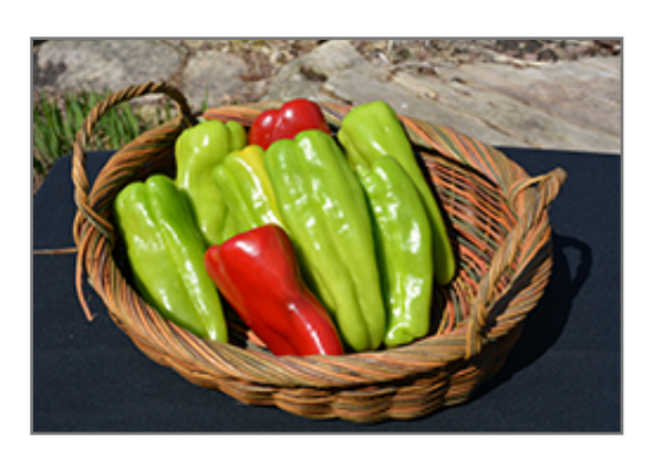
Giant Marconi Pepper fruit

Giant Marconi Pepper will grow to be about 30 inches tall at maturity, with a spread of 24 inches. When planted in rows, individual plants should be spaced approximately 24 inches apart. This vegetable plant is an annual, which means that it will grow for one season in your garden and then die after producing a crop.