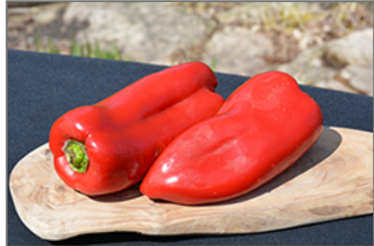
Gypsy Sweet Pepper fruit

Gypsy Sweet Pepper will grow to be about 24 inches tall at maturity, with a spread of 12 inches. When planted in rows, individual plants should be spaced approximately 18 inches apart. This vegetable plant is an annual, which means that it will grow for one season in your garden and then die after producing a crop.